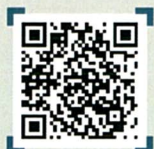
澳門扶康會介紹影片 Fuhong Society of Macau Introduction Video

Our organization is now operating 12 service units, which mainly provides services for people with intellectual disabilities, autistic person and people with ex-mentally illness. During the past 17 years, we are not only giving opportunities for them to learn more skills and knowledge but also providing a comprehensive occupational rehabilitation and employment support services.